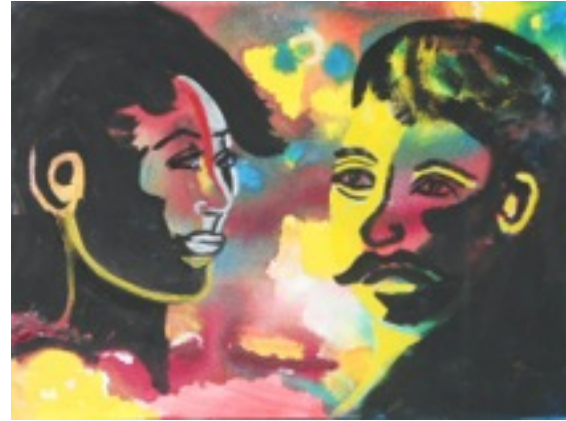
Byron Falls in Love Acrylics

RECEPTION: 12:00 and 4:00 P.M. on Saturday February 28 th , 2015