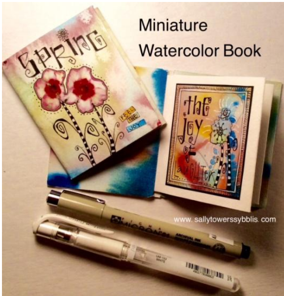
Miniature Watercolor Book

Come to create a miniature watercolor book that is so tiny, it fits in the palm of your hand. Add in some whimsical flowers and your own text as well as cut out shapes and borders, perhaps a garden quote or two. This class is nothing but pure enjoyment! Once your papers are painted, I'm going to show you how to fold your tiny book. Design your book to give as a special occasion card or a piece of art to add to your